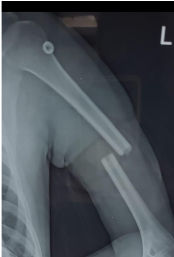
Figure 4: AO type 12A3 shaft humerus fracture

anterior surface of the bone in this alternative method to osteosynthesis for humeral shaft non-union. The biological advantages of using a technique that uses a plane between nerves to lessen harm to soft tissues undoubtedly played a role in the success of the experiment. [9] We performed present study to compare humeral interlocking nail and compression plating in fracture of shaft of humerus cases.