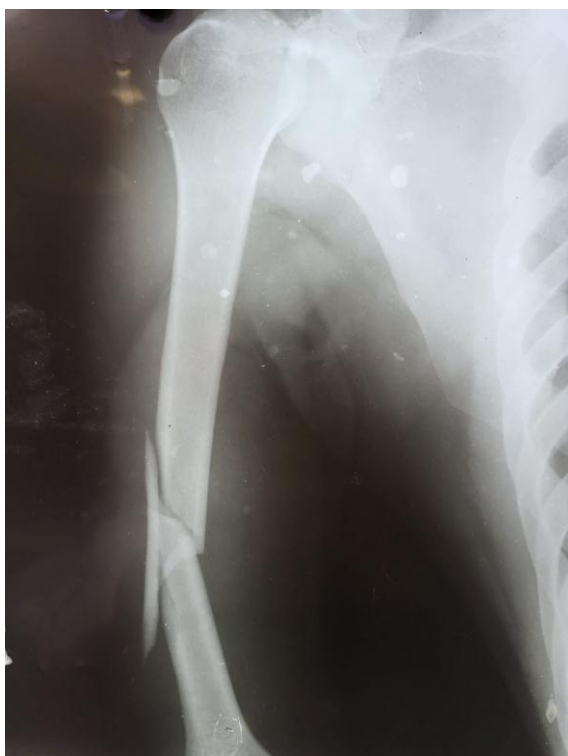
Figure 2: AO type 12B1 shaft humerus fracture

Complications seen were implant failure 1 in group I and 2 in group II, non-union 2 in group I and 3 in group II, shortening seen in 1 in group I and 2 in group II, superficial infection 1 in group I and 2 in group II, and deep infection 1 in group I and 2 in group II. The difference was non-significant ( P > 0.05 ) [Figure 1].