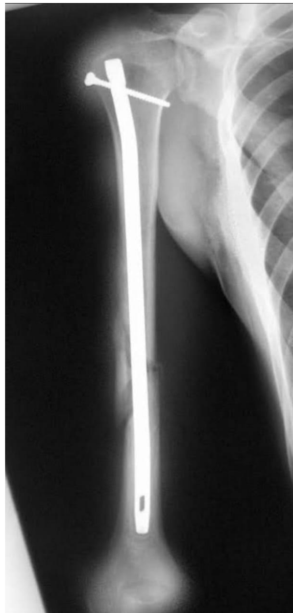
Figure 3: Managed by Humerus interlocking nail